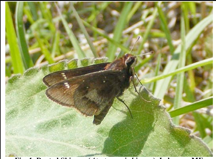
Fig. 1. Dusted Skipper ( Atrytonopsis hianna ), Lebanon, ME (York County), June 1, 2012.

The area where the colony was located is rocky and slightly elevated (mounded) from the surrounding ground (Fig. 2). Compared to the rest of the adjacent habitat, the