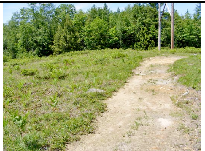
Fig. 2. View of the Dusted Skipper habitat at the Lebanon, ME site on June 1, 2012.

elevated area is much drier with poor growth of shrubby plants which allows shorter grasses to grow. The entire colony appeared to be localized to a fairly small area (roughly 150 feet by 50 feet in size). We noticed that the Dusted Skippers did not wander far from the elevated portion of the power line right of way even though we did extensive searching away from the colony center to find more skippers. This is one of the few areas on this section of the right of way which is dry. At the bottom of the mounded area where the skipper colony was located (about 150 feet away), the habitat is very wet (boggy) with cranberry plants and later in the season, supports a small population of Bog Coppers ( Lycaena epixanthe ).